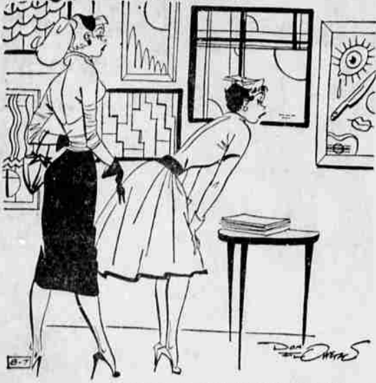
"No, I can't figure out the signature, either!"