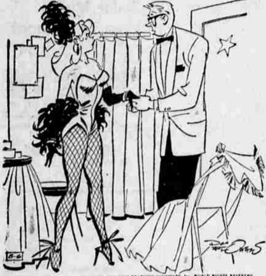
"When I proposed last night, did you say, 'yes' or 'no'?"