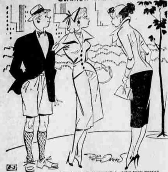
"I can hardly wait for cold weather!"