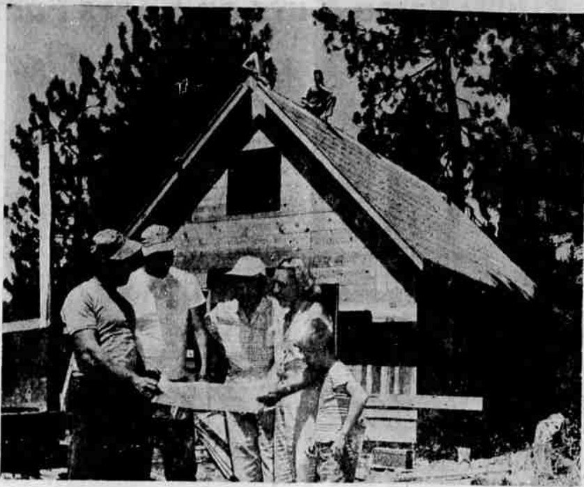
FIRST SUMMER CABIN in the Frontier Guest Ranch real estate development nears completion on a site where there was nothing 10 days ago.

CHICAGO LIVESTOCK CHICAGO (AP)—Prices climbed 25 to 50 cents Wednesday on both butchers and sows. Choice 150 to 240 pound butchers sold mainly at $22.50 to $23.00.