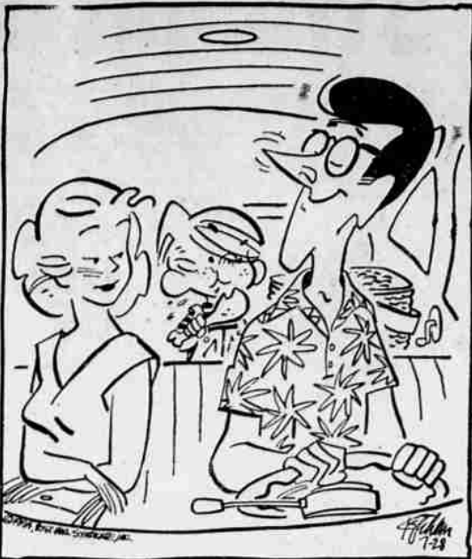
"MMMMM, THAT FRIED CHICKEN! I CAN SMELL IT THROUGH ALL THAT WAX PAPER AND THE PICNIC BASKET!"