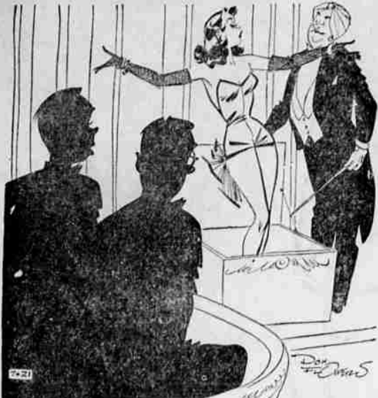
"It's a good trick, but that was a BLONDE he put in there!"