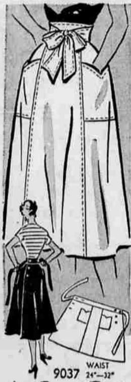
9037 WAIST 24"-32" by Marian Martin

This easy-to-use pattern gives perfect fit. Complete, illustrated Sew Chart shows you every step. Send Thirty-five cents in coins for this pattern—add 5 cents for each pattern for 1st-class mailing. Send to Marian Martin, care of Herald and News, Pattern Dept., P.O. Box 6740, Chicago 80, Ill. Print your name, address, zone; size, style number.