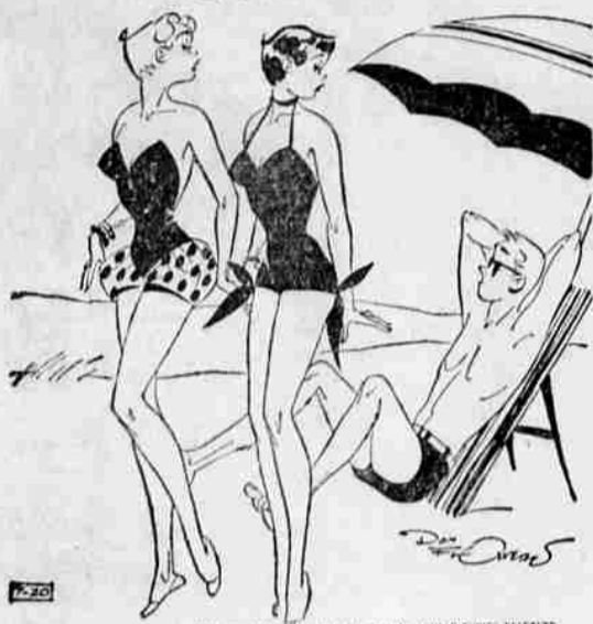
"Let's walk past again. He's just playing possum!"