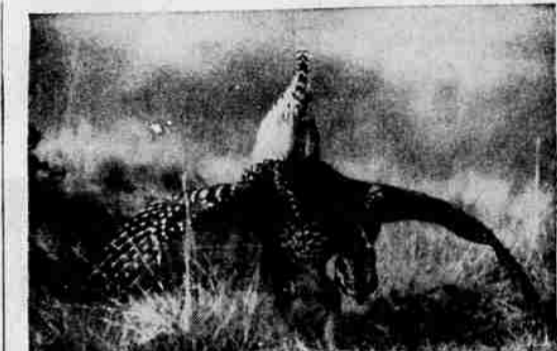
SHARP-TAILED GROUSE , noted for their elaborate dances in the spring, are coming back to Oregon. Four were spotted this spring in the lower Powder River Valley east of Baker. This one is dancing vigorously to woo a lady grouse. These birds once were plentiful, but they disappeared several years ago. They like undisturbed land, and move out when the farmers move in.

Husbands! Wives! Get Pep, Vim; Feel Younger Thousands of couples are weak, worn-out, exhausted because body lacks iron. For younger feeling after 40, try OTC's Tonic Tablets. Contains iron for pep; supplement does vitamins B and B 12 . Costs little. "Get acquainted" size only 50¢. At all drugstores.