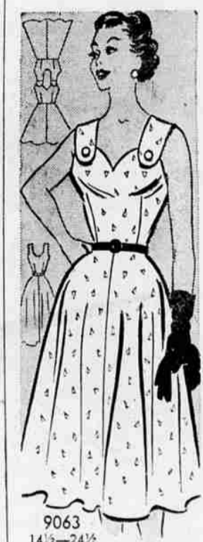
9063 14 1/2 - 24 1/2 by Marian Martin

Sew-easy sun frock for half-sizes that's actually cut to properly fit the shorter, fuller figure! It's delightfully cool and comfortable for chore-time, too - AND it's a cinch to iron! Smart tab-strap bodice tops the flared skirt. Choose cool cotton!