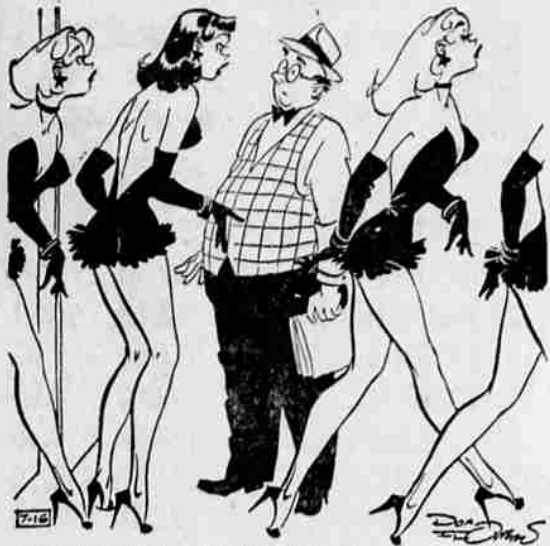
"Either we're short one costume or somebody's wearing TWO!"