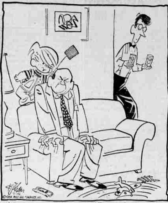
"Boy, what a big, fat fly he was!"