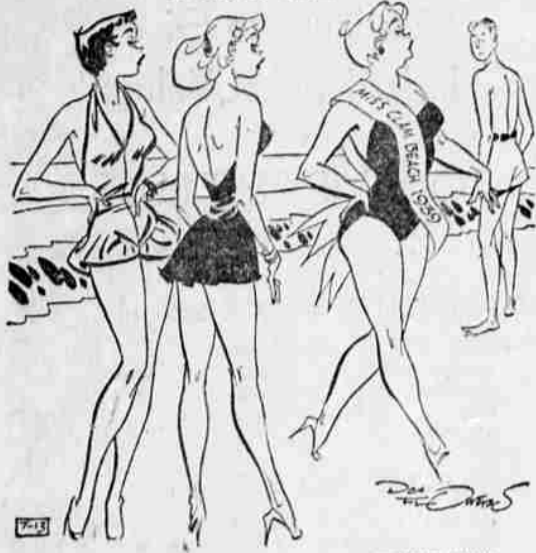
"She's not letting anybody forget!"