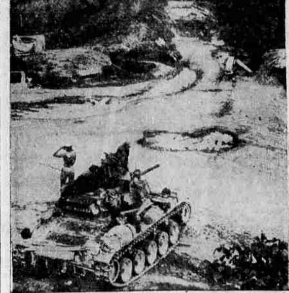
A FRENCH TANK makes its way down a muddy road in the Red River Delta area setting up roadblocks in its wake, during the general withdrawal to the Hanoi area. Though pledged to defend Hanoi "savagely," the French have begun to evacuate some 6000 families from the city. Loyal troops are already battling infiltration Viet Minh Reds only six miles southwest of the endangered war capital.