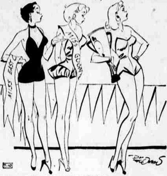
"She won it fair and square. Or perhaps SQUARE isn't exactly the word."