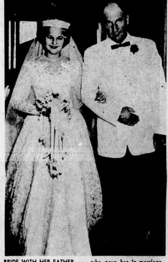
BRIDE WITH HER FATHER... who gave her in marriage.