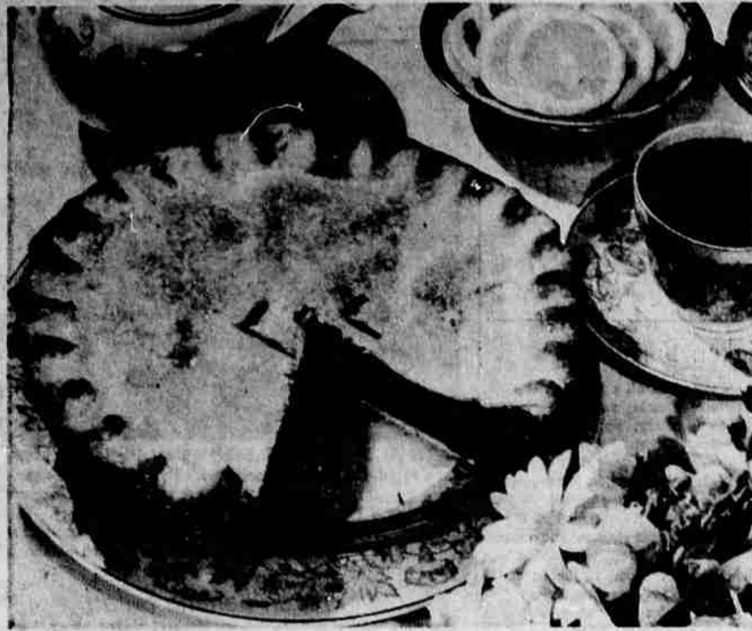
SUN-RIPENED SWEETNESS of juicy plums is found between the crusts of this fresh fruit pie. The juice is gently restrained with quick-cooking tapioca—a wonderful thickener for all fruit pies.