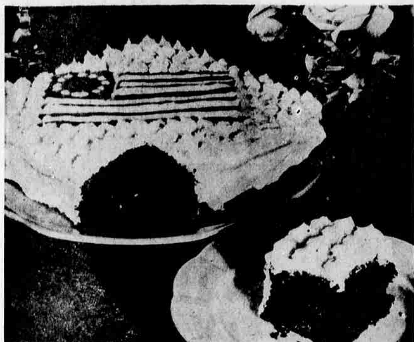
FOURTH OF JULY picnic or special celebration? Then by all means take a cake that carries out the theme of Independence Day, complete with a replica of our first American flag (you need make only 13 dots in the field). It's easy to make this beautiful cake when you use Cinch Cake Mix.