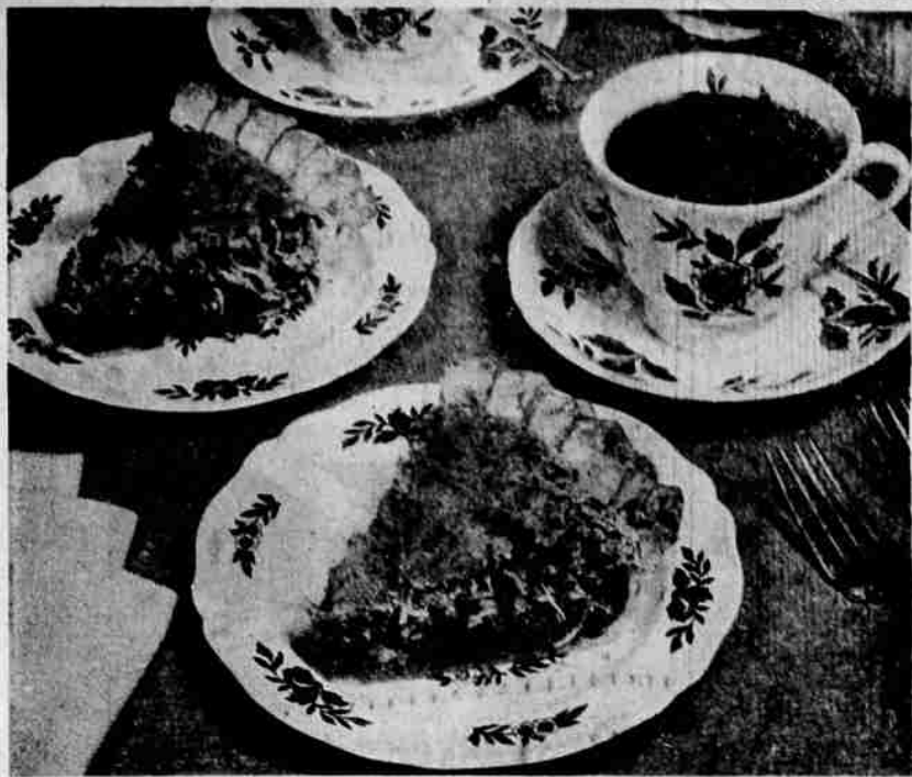
COFFEE-MACAROON PIE makes a wonderful dessert and it uses that last quarter-cup of coffee left from breakfast. Even though the coffee blends so well with the almond flavor that it's only hinted at, you'll find that it gives the pie a subtle affinity for the fresh hot coffee served with it.