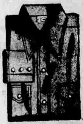
FINE WESTERN SHIRTS 4.98 Ea. Sizes 24-32 Hand washable Handsome styled gambler model for good looks and form-fitting comfort. Tailored of crease-resistant rayon gabardine or Sanforized cotton broadcloth. Arizona wing pockets, pearl-type snaps. Rich colors.