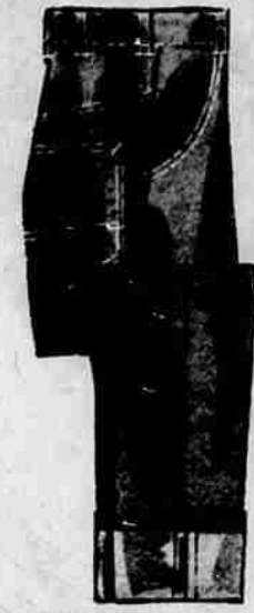
STYLED IN THE WEST 2.79 Saddle pants of extra-tough 11-oz. white back blue denim. Popular Western construction with snug-fitting seat and leg. Non-chafing flat pressed outseams, double-seam inseams for greater strength. Bar-tacked strain points. Zipper front. Sanforized. In men's sizes 30 to 36.