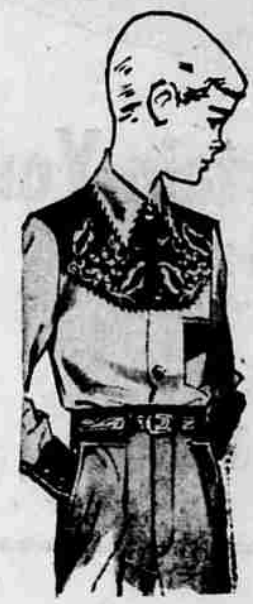
WESTERN FOR JRS. 1.98 A young boy likes to dress the same as his television and movie heroes. This Western-style shirt is sure to please him. Made of Sanforized cotton poplin in handsome, contrasting colors. Printed wild-flower designs on chest. He'll wear this shirt everywhere. Sizes 4-12.