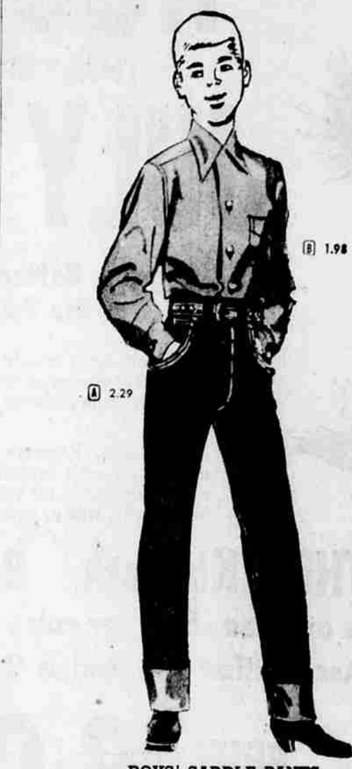
BOYS' SADDLE PANTS White-back denim 2.79 Sanforized Ⓐ The Pants that boys all over are demanding. Authentic westerns with tapered legs, low waist, snug seat, orange stitching. 11-oz. denim. 6-14 $1.60 Ⓑ Rayon-gabardine Shirt. Solid colors. 6-18. 1.98