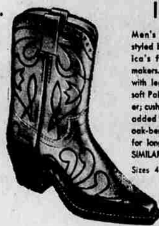
WARDS "101" BRAND BOOTS 15.97 Men's rugged boots styled by one of America's foremost boot-makers. Sturdily made with leg and vamp of soft Palomina-tan leather; cushioned insoles for added walking comfort; oak-band leather soles for longer wear. 6-11; SIMILAR style for children. Sizes 4 to 3 . . . 5.98