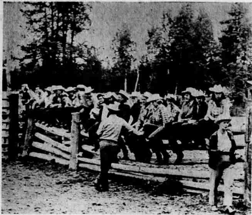
THE TOP RAIL was taking a beating out at the Rafter MD when this crowd of spectators lined up to watch some of the queen contestants try their luck at calf roping. Nope! The rail didn't bust. It stood up to the load nobly.