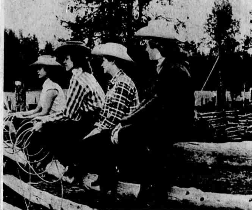
PRETTY GIRLS lined up along the top rail of the fence are a sure sign that there's activity going on out in the ring. This foursome was snapped at the Rafter MD Ranch.