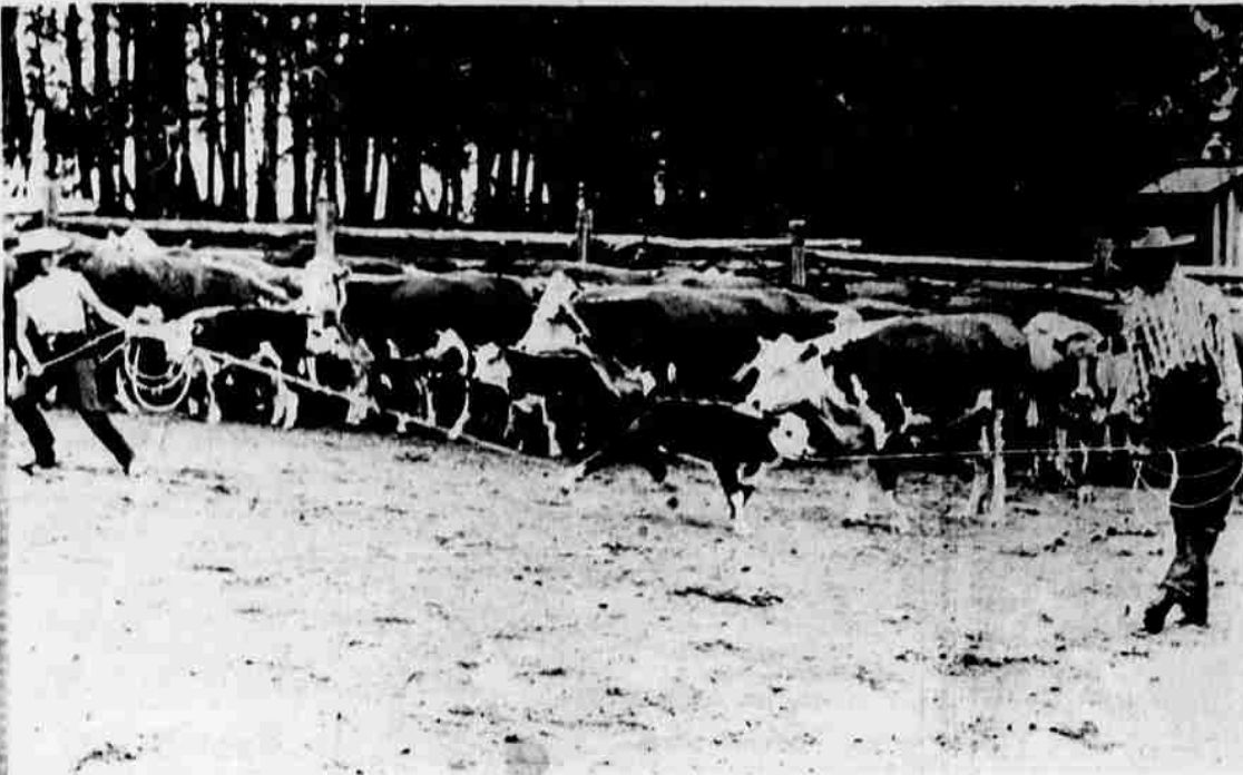
ALL STRUNG OUT and no place to go is the fate of this little calf when a couple of queen contestants slapped a rope on him and held him for the cowhand with the iron.