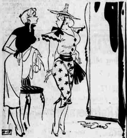
"Sometimes, Madam, it's a mistake to look in the mirror."