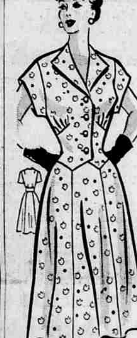
9371 14 1/2-24 1/2 by Marianne Martin

Young slim lines are especially flattering to the short, fuller figure. Note the novel waist influence of the bodice—this is very popular now! Note the cool, turnback revers, the graceful flare of the skirt. Proportioned to fit—no alteration problems. Pattern 9371: Half Sizes 14 1/2, 16 1/2, 18 1/2, 20 1/2, 22 1/2, 24 1/2. Size 16 1/2 takes 3 yards 35-inch fabric. This easy-to-use pattern gives perfect fit. Complete, illustrated Sew Chart shows you every step. Send thirty-five cents in coins for this pattern—add 5 cents for each pattern for 1st-class mailing. Send to Marianne Martin, care of Herald and News, Pattern Dept., P.O. Box 6740, Chicago 80, Ill. Print your name, address, zone, size, style number.