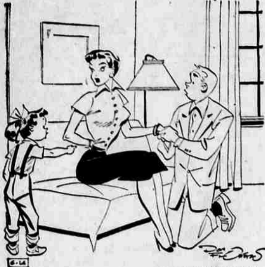
"Look out! She's got her fingers crossed!"