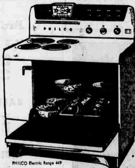
PHILCO Electric Range 449

HOLDS MORE! 66 2/3 cubic inches to hold the largest turkey, or roast. Bakes six 9" pies all at once!