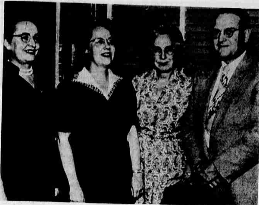
THESE FOUR KLAMATH COUNTY educators will attend the fourteenth summer meeting of the National Council of Teachers of Mathematics...