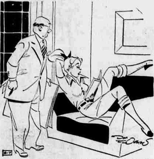
"It's a book all about correct posture for health."

© 1954, THE KING FEATURES SYNDICATE, INC., WORLD RIGHTS RESERVED.