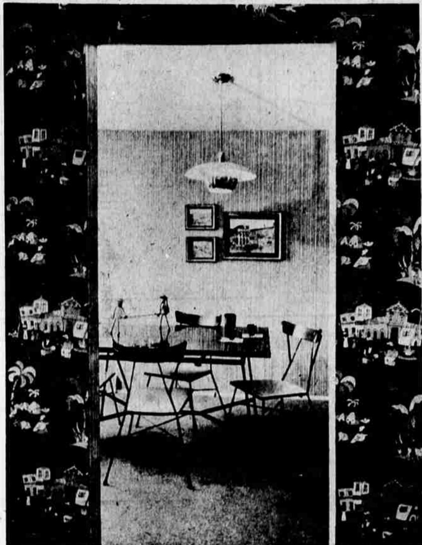
YOUR NEW WALLPAPER can lead you all through the house with delightful room-to-room color tie-ins. Here you see the dining room from a kitchen view. Like soft background music, the textured wallpaper in the dining room echoes the bright and beautiful colors of the tropical pattern framing the kitchen door. To give your home a spacious look, the Wallpaper Council advises that you start your color scheme in the living room and carry it all through the house. Avoid monotone, but choose complementary colors for contrast.