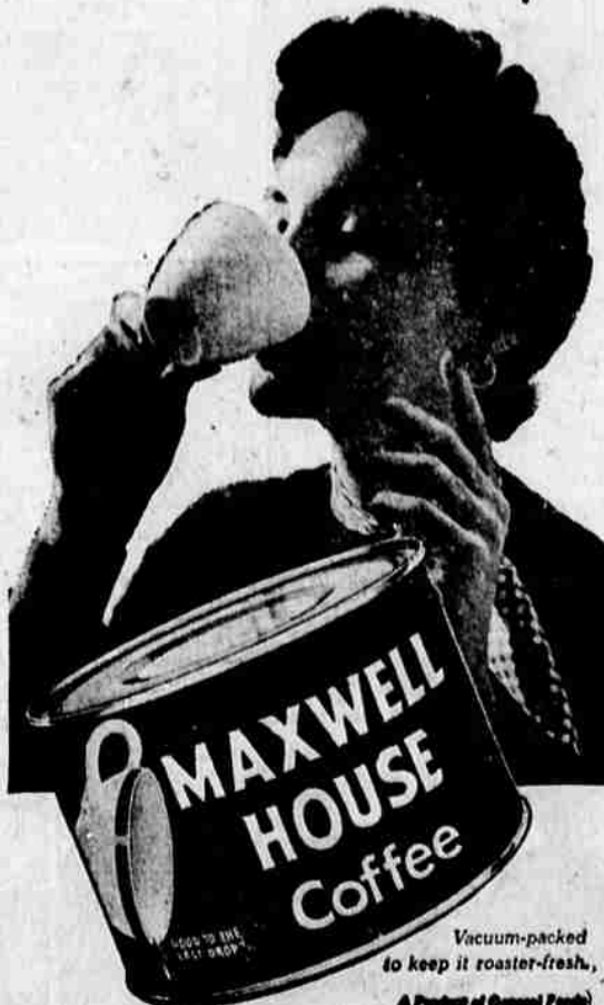
Vacuum-packed to keep it roaster-fresh. A Product of General Foods

MAKE SURE you get the one coffee you know is GOOD TO THE LAST DROP