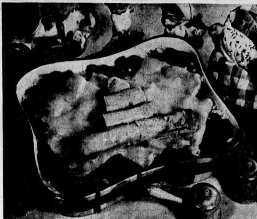
SOMBRERO TAMALES make a delicious casserole of satisfying food which all the "cow punchers" in your family will praise. Place a 15-oz. can or jar of tamales and sauce in the bottom of a greased two-quart baking dish. Top with 3 cups cooked rice. Pour a 15 1/2-oz. can of chili con carne with beans over the rice. Add 3/4 cup water, and top with 1/4 lb. American cheese sliced. Place in a 350 degree oven for 30 minutes or until the cheese has melted and the tamales, rice and chili con carne mixture is heated through. If desired, save out three of the tamales and arrange them on top of the cheese in the shape of a sombrero as pictured. Do this about 10 minutes before the cooking time is over in order that these tamales may become hot.

WEISFIELD'S Headquarters For Famous GENERAL ELECTRIC APPLIANCES WEISFIELD'S FAMOUS LOW EASY CREDIT TERMS