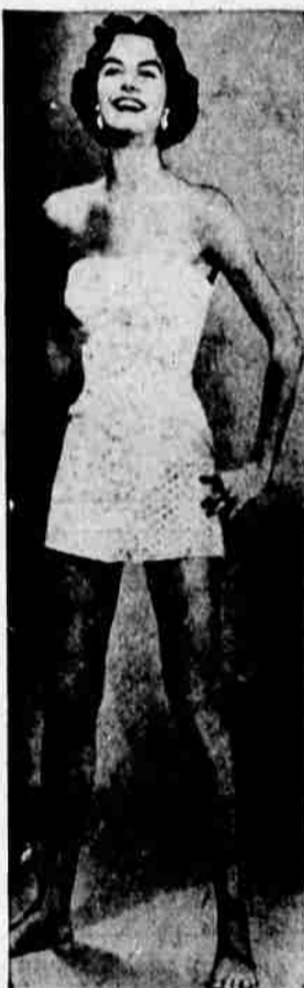
"YOUNG SOPHISTICATE," a shortmaker from the Rose Marie Reid collection, was created to fit with the easy flattery of a favorite pair of shorts, and to take a firm hand with wayward figures because it is elasticized. Actually embroidered with cloud-and-star patterns on white, navy, ocean pearl, brown or jade. Available locally, it comes in sizes 12 to 20.