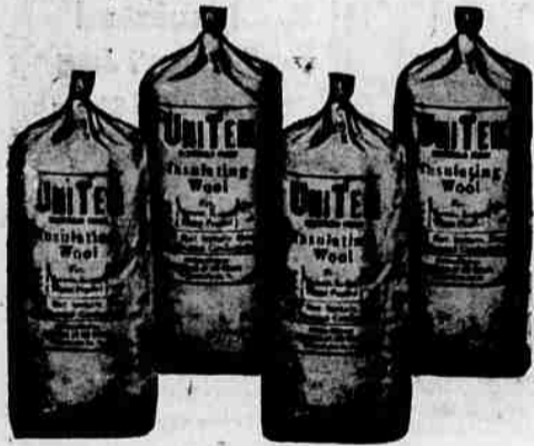
Reg. 1.55 UNITEM INSULATION

Automatic, with adjustable thermostat from 120° to 180°F. 30-gal. capacity—large enough for average family. Extra-heavy galvanized steel tank. Double heating elements. White baked enamel finish. Approved by UL. 40-GAL. SIZE, 84.88. 50-GAL. SIZE, 95.88.