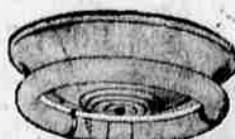
REG. 9.49 CIRCLINE 8.44

Recessed—8 3/4 x 8 3/4 x 4 1/4-in. Frame fits flush to ceiling. Hinged for easy bulb changing. Uses 100-W bulb.