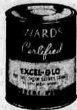
2.15 QUART EXCEL-GLO

Protects wood, metal and brick from hard wear, weather and water. Dries overnight. Colors. Gallon..... 4.69