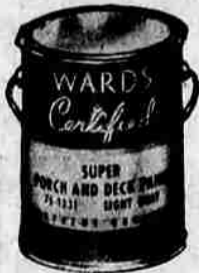
PORCH AND DECK PAINT

Extra protection—extra durability. Exposed surface twice as thick as ordinary shingles. Choice of attractive colors.