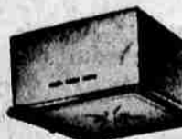
REG. 4.75 FIXTURE 3.88 ea.

An outstanding offer—two quarts for the price of one. Soft-sheen, washable enamel for every room. Self-sealing.