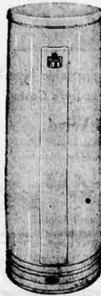
ELECTRIC WATER HEATER 84.88

Porcelain-enamelled top resists household stains, acids, wipes clean easily. Roomy double drainboard. 2 drawers, 3 compartments. With fittings.