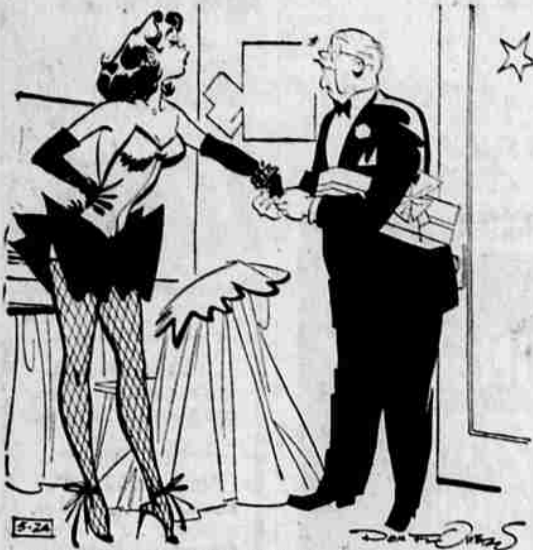
But that line goes, 'In the spring, a YOUNG man's fancy...'