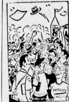
"Okay, you don't like betting on the horses... then just enjoy watching them run, the fresh air, the women's fashions!"