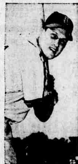
STAN MUSIAL ...paces Cards

Along with the title the Ducks would get an automatic bid to the Far West NCAA playoffs May 29-31, playing against Southern California, Seattle University and Fresno State for a berth in the national NCAA playoffs at Omaha.