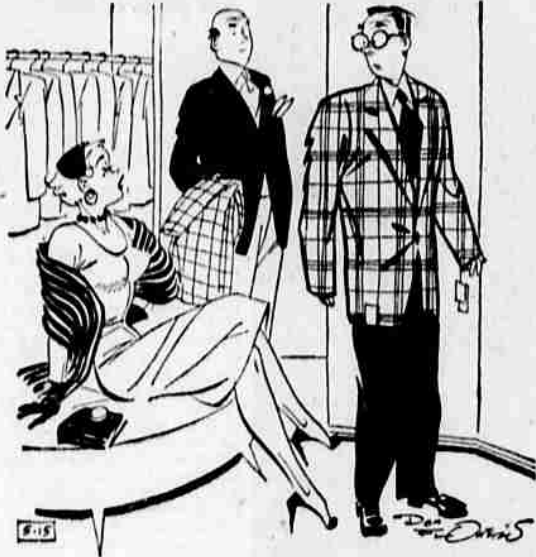
"I'm afraid, Roger, you're not THAT much of a sport."