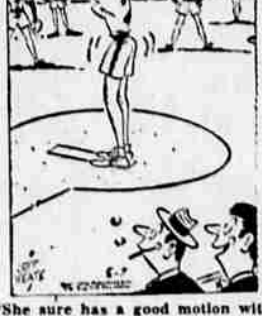
"She sure has a good motion with runners on base... or when they're not, for that matter!"