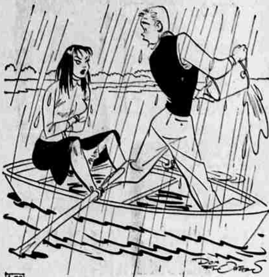
Help me bail, or I'll lose my deposit on this boat!"