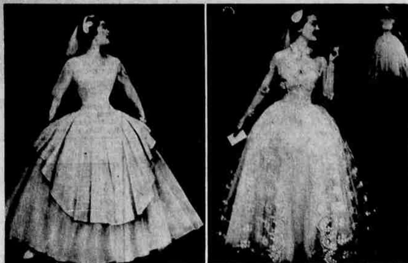
BRIDES AND SPRING go hand in hand. Nothing could be prettier than the new collections of Milady Bridals' wedding and bridesmaid gowns. The divine bridal gown of embroidered yarn dyed taffeta and cloud-soft-tulle is a heavenly combination. This captivating gown is enhanced by a lovely scalloped neckline, and doll-size waist, lined with solid yarn-dyed taffeta. The exquisite floor-length double-duty redingote of embroidered nylon tulle is charmingly scalloped all the way down the front. It is a vision of enchantment at the wedding—without the dainty coat (see insert), a glamorous formal of embroidered and plain nylon for dancing. Both models are available in Klamath.