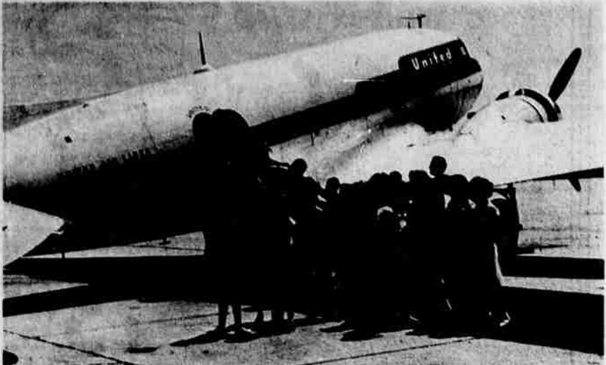
A VISIT TO THE AIRLINES was paid Thursday by students from the Bonanza School. The youngsters were shown through the CAA communications setup, the United and West Coast offices and baggage stations and then waited for a scheduled flight to go through and were given a chance to inspect the big airliner.