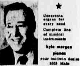
Consistent organ for every need. Complete line of musical instruments. kyle morgan piano four Baldwin dealer 3033 Main