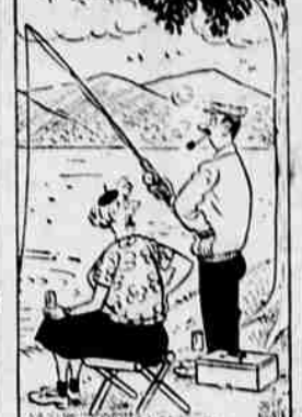
"Well, how long does this go on? I've shown infinite patience for ten minutes now!"