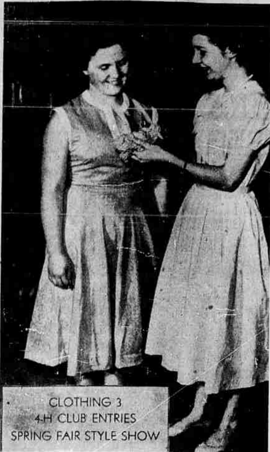
CLOTHING 3 4-H CLUB ENTRIES SPRING FAIR STYLE SHOW

Senior announcements are ready so dig deep, pals, this is only the beginning. Already we seniors are being warned of final exams. Oh well, I guess every silver cloud has its dark lining — or am I misquoting?