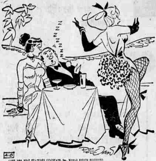
"I realize you tired business men must relax—but—!"