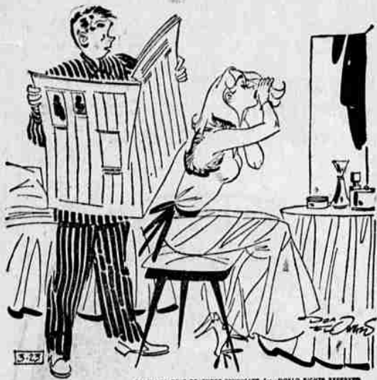
"Here's a bigamist says he needed the extra tax exemption."

Due to technical difficulties the crossword puzzles will not appear for this week. They will resume Next Monday, March 29.