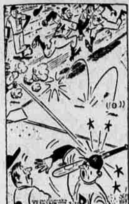
"Some of these rookies sure get excited their first time at bat in a big-league camp, don't they!"