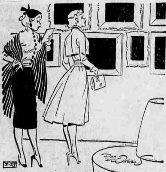
"The catalogue says he does all his paintings at night."