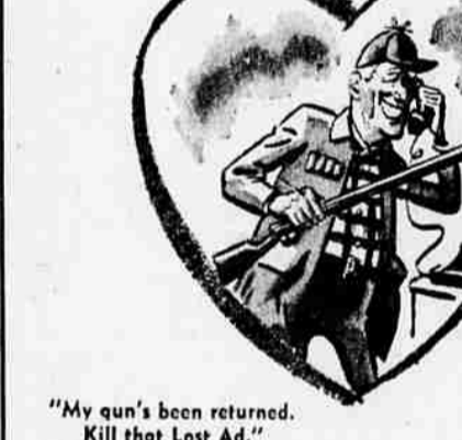
"My gun's been returned. Kill that Lost Ad."