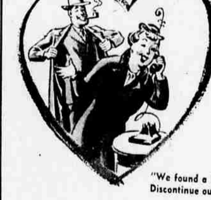
"We found a house. Discontinue our ad."