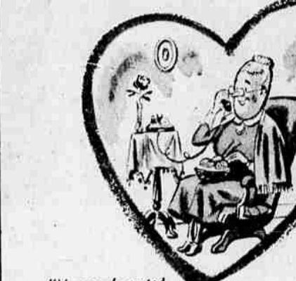
"My room's rented. Please cancel the ad."