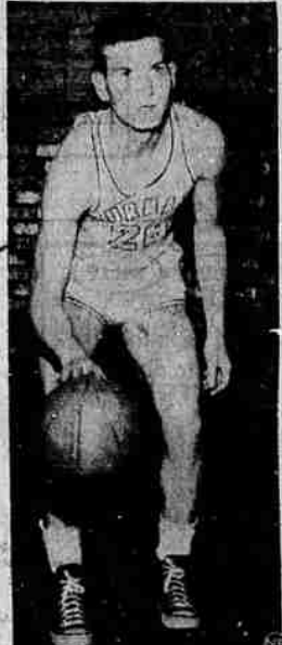
FRANK SELVY ... for him, it's easy

GREENVILLE, S.C. (AP) — They call him "The Scorer." Frank Selvy "Fabo" Selvy and with a new major college three-year basketball scoring record under his belt and 12 games left to play, Selvy likely will keep the appellation for a long time. Selvy scored 25 points Monday night as Furman defeated Clemson 70-55 and now has a three-year total of 1,905 points. The old record was 1,888 by Clyde Lovellette of Kansas in 1952. NOT NEW Throwing a basketball through a hoop is nothing to the Corbin, Ky., star. The 6-3 senior set a national record for major colleges last year, bagging 738 points in 45 games for a 29.5 average. His sophomore year he finished sixth in the nation with a 24.6 average for 591 points scored in 24 games. Selvy's performance this season is nothing short of amazing, considering he has had to carry a major part of Furman's Southern Conference load. FOUL OUT Last week The Citadel put three men on Selvy. Before the game was over all had fouled out. Selvy scored 53 points, 25 of them on free throws. Neither has the modest Selvy's points come against any set ups. Selvy scored 21 against North Carolina State, 40 against Duke and in the Oklahoma City All-College Tournament, 45 against Mississippi and 50 against Cincinnati. Duke Coach Harold Bradley admitted, "we used every type of defense on Selvy. He earned every point he made."