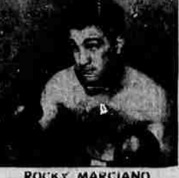
ROCKY MARCIANO ... old men bother him

been doing for nigh on to 30 years. In view of the circumstances, it was a remarkable performance. Bucceroni with that prognathous jaw, couldn't sleep. To come in at 175 on the nose, he ran four solid hours in a plastic sweat box suit to knock off five pounds. Despite all that, he made a highly satisfactory fight winning 13 of 15 rounds from a cagey fellow against whom it is difficult for anyone to look good. "I couldn't get him off me," said Joey Maxim. Neither would Rocky Marciano until he pinned him to the floor.