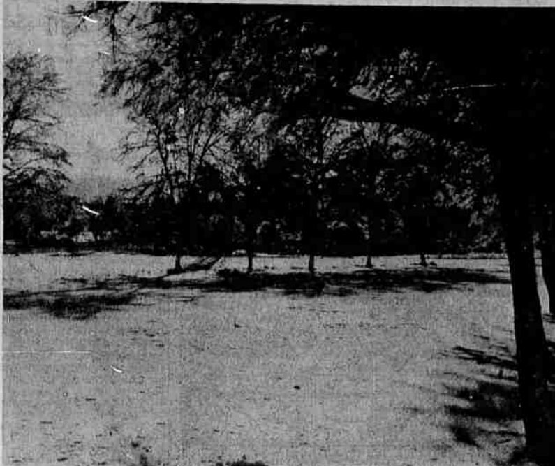
MOORE PARK TOOK ON WINTER ATTIRE this week when the first snows of '54 covered the entrance way and lawn areas. This picture was snapped Sunday during a brief period of sunlight.