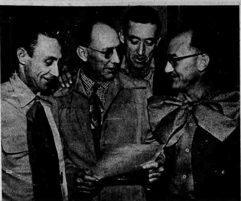
LOUD TIES WILL HELP SWELL the March of Dimes Fund at the dance at the Eagles Lodge Saturday night, January 23. All funds from the dance will go to the polio campaign...