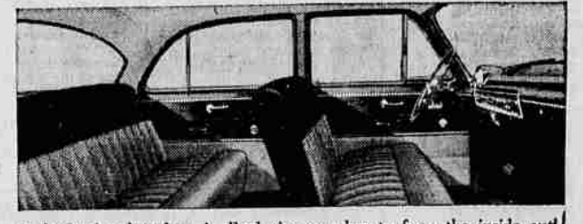
Style-Setting Interiors in Ford give you beauty from the inside out! Colorful new upholstery fabrics and smart trim are another '54 Ford dividend . . . help make Ford the style leader of the industry.