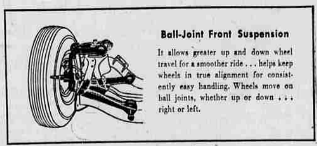
Ball-Joint Front Suspension It allows greater up and down wheel travel for a smoother ride . . . helps keep wheels in true alignment for consistently easy handling. Wheels move on ball joints, whether up or down . . . right or left.

The '54 Ford gives you extra Dividends in style, in performance, in ride, with fine-car features you would normally expect to find only in highest-priced cars.