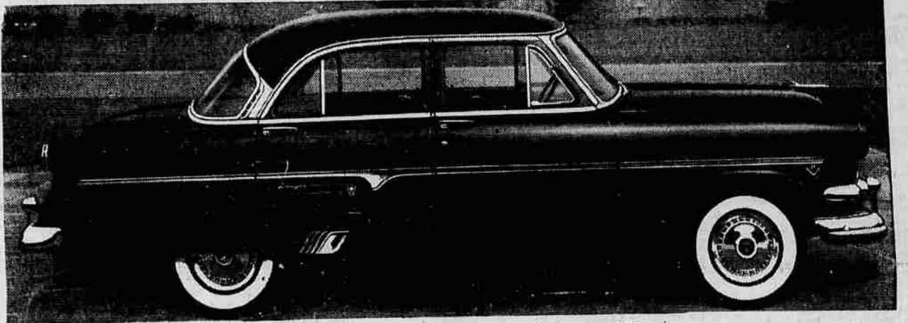
Fine-car Styling An outstanding example of fine-car beauty in the low-price field . . . the new Crestline Fordor is the fashion car for the American Road.