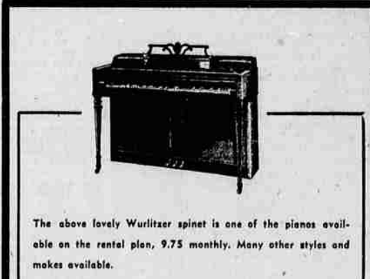
The above lovely Wurlitzer spinet is one of the pianos available on the rental plan, 9.75 monthly. Many other styles and makes available.

Think what it will mean if your boy or girl when grown to adulthood can play the piano.