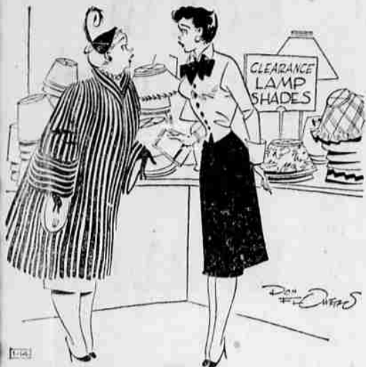
"Something for my husband to wear at a party."