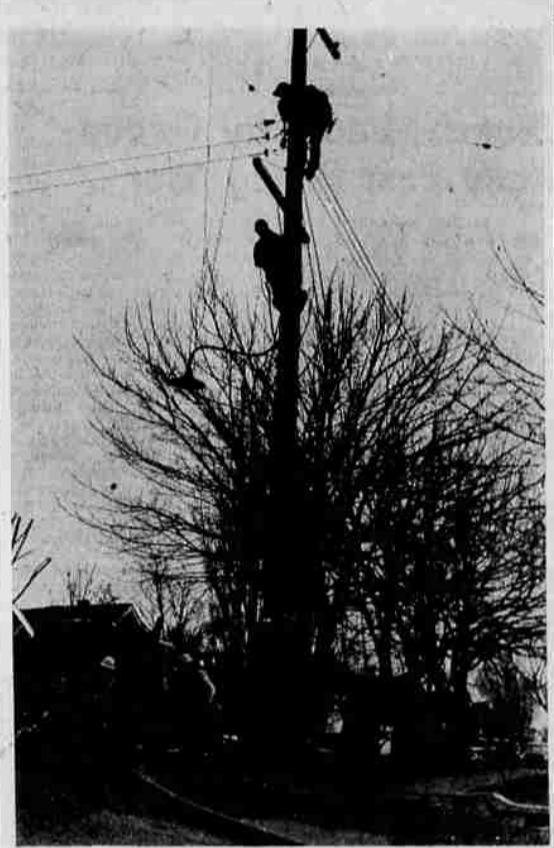
HIGH ABOVE THE GROUND these Copco workers were busy at the corner of Fourth and Jefferson the other day putting in one of the new, taller poles.

FORECAST—Klamath Falls and vicinity: Occasional snow flurries through Friday. High Friday 30; low Thursday night 22.